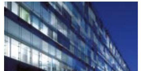
Façade by night