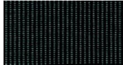
Carpet detail "Flatwool stripe"

No matter how hyper-complex, vitally excited, fragmentary, and dispersed the building may present itself as being from the outside, a transformation of atmosphere surprises the visitor to the interior. Here the structure seems generous and open, elegant and, above all, tranquil. The image of a unity formed out of many complex details is transformed on the inside into a concentrated expansiveness where individual strongly-coloured pieces of glass stand out - almost like monochrome paintings. Yet colourfulness does not dominate the interior space. Almost imperceptibly it brightens the overall light. Astonishingly the several layers of superimposition do not disturb the view either. Quite the contrary. One has the impression that outer and inner space merge almost seamlessly as if there were not any great diversity of layers of glass. Strangely - and perhaps this results from the shades of colour involved - the transparent materiality of glass is sufficient to generate the impression of a sheath which provides refuge.