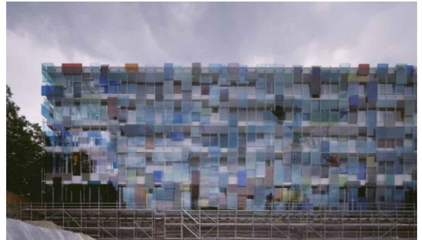
Glass façade of the Novartis Campus Forum in Basel