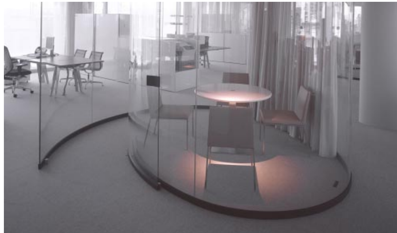
Transparent glass cubes can be used as meeting rooms.