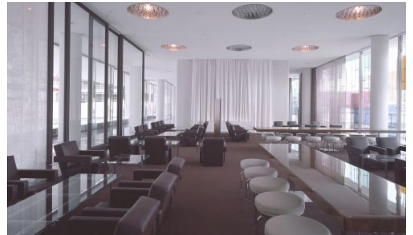
Lounge designed in calm and elegant shades.